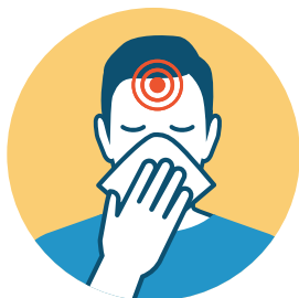
CONGESTION OR RUNNY NOSE