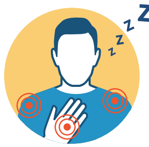
MUSCLE PAIN AND FATIGUE