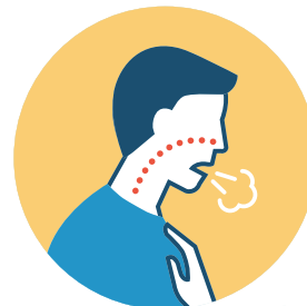
SHORTNESS OF BREATH OR DIFFICULTY BREATHING