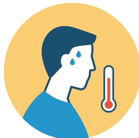
FEVER 100.4* *or school board policy if threshold is lower