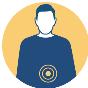
NAUSEA OR VOMITING